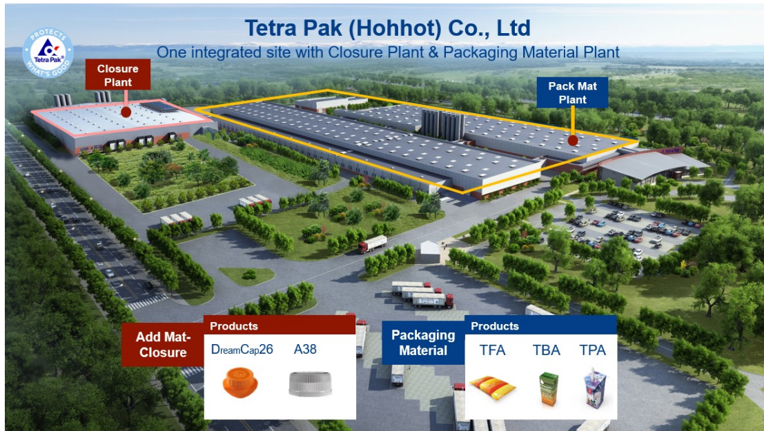
Figure 1-2 Hohhot Factory of Pack Mat and Closure Plant

Tetra Pak (Hohhot) Co., Ltd (below refer to Hohhot Company) has two plants, they are Pack-mat plant (produce packaging material) and closure plant (produce closures) belongs to one legal entity.